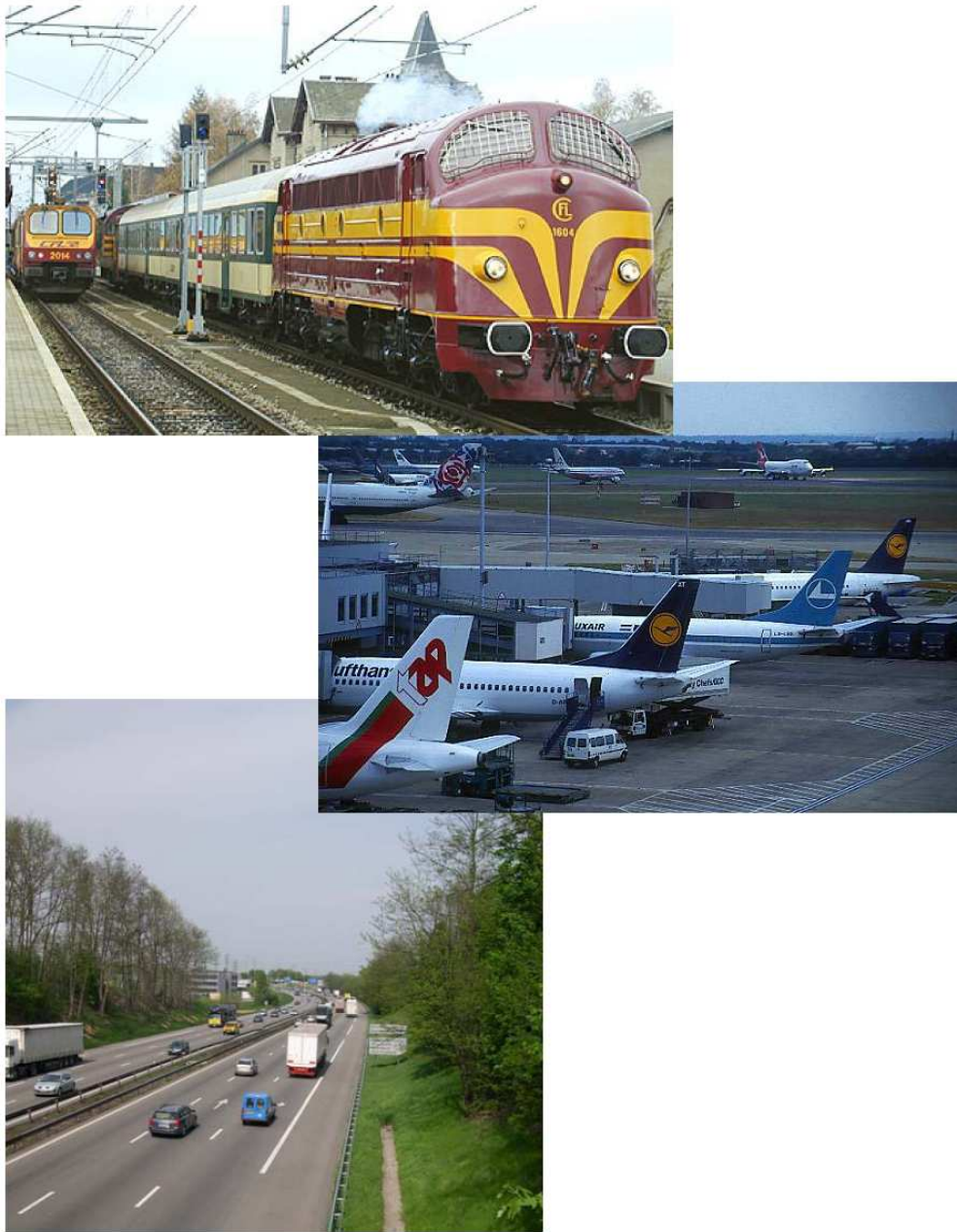
Figure 2. Transportation means can exemplify the organization of scientific research: for instance, rigid paths (trains), limited number of arrival points (aircraft), flexibility of routes and aims (cars and parent vehicles). Taken globally, car driving, with its topology (incl. exploration out of established roads and itineraries) and phenomenology (incl. initiatives, mistakes and wrong choices by drivers), can be seen as one of the best examples of a distributed intelligence modelling dynamic research.